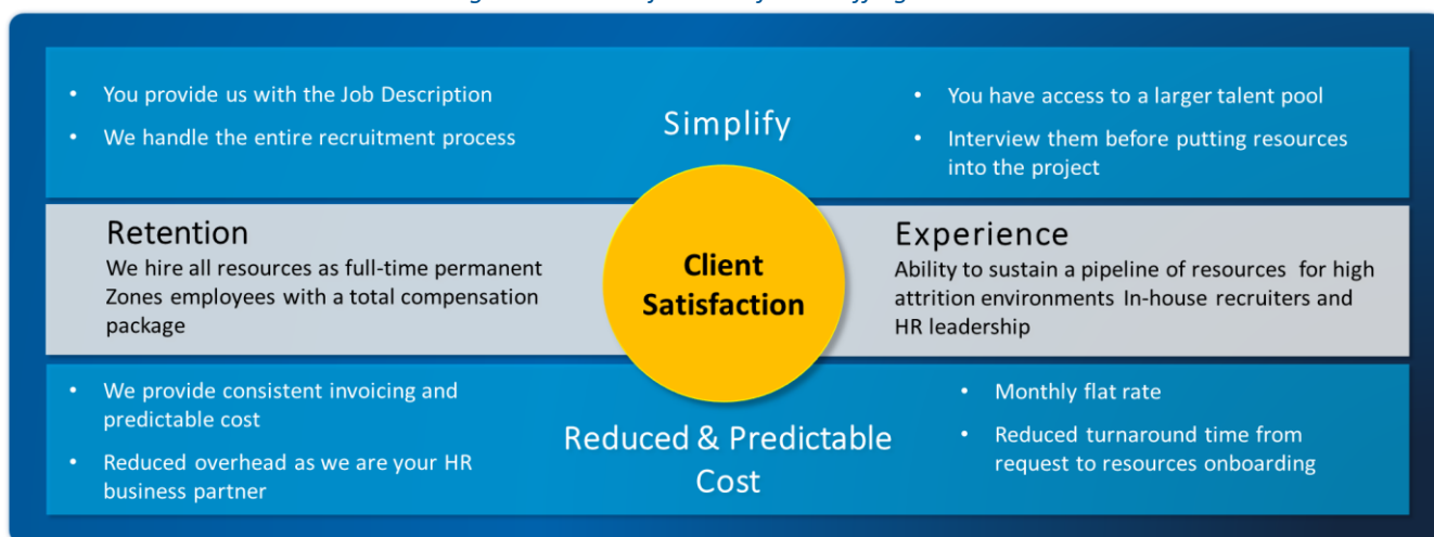
Figure 61: The objectives of our staffing services

Zones has the talent pool and global reach to provide resources that fit your precise requirements in more than 25 languages – including English.