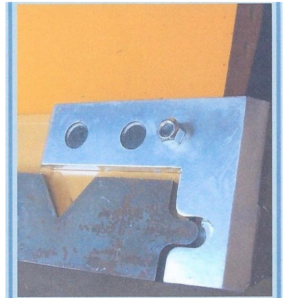
(Above): Left-Side (MAG-500) Carbide Casting End Guard with Maximum-Duty Attachment Bracket. End Guards are Manufactured with Various Degrees of Wear-Angle Depending on Customers Needs.

Above: Oklahoma Turnpike Authority (OTA) 12-ft MHL Interlocking (MAG/500) Snow Plow Blade with Right-End Guard