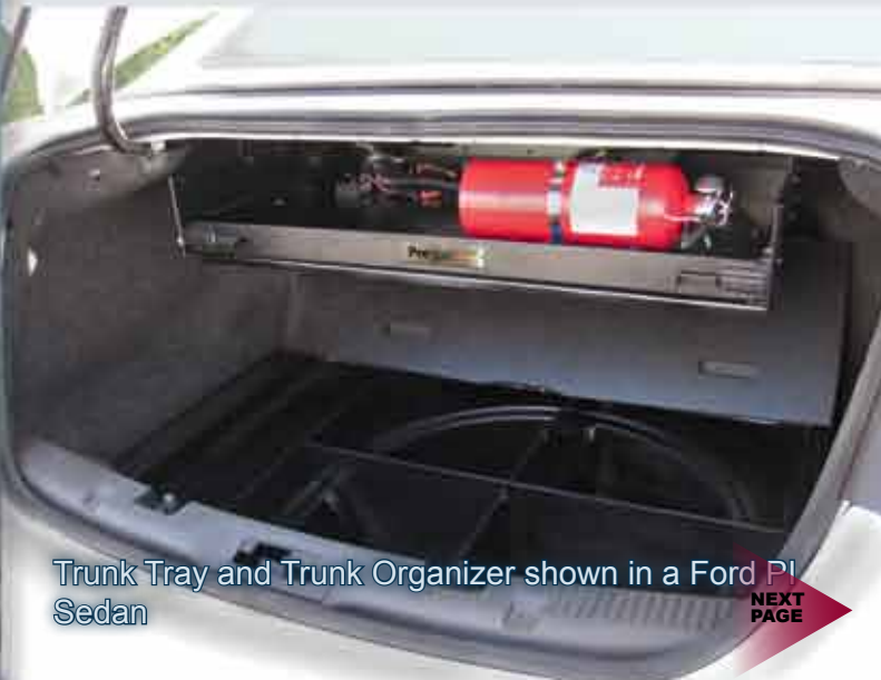
Trunk Tray and Trunk Organizer shown in a Ford PI Sedan

Equipping them with our storage and organization units keeps them organized and prepared so they can grab what they need and focus on the situation at hand.