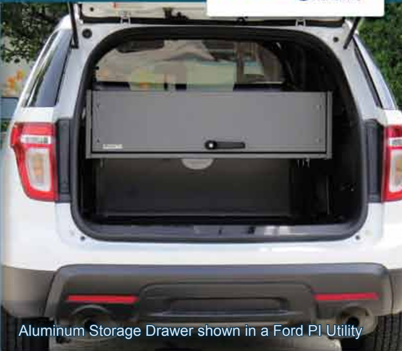
Aluminum Storage Drawer shown in a Ford PI Utility

Trays glide out easily for technicians when servicing and lock tightly in place during travel