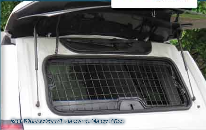
Rear Window Guards shown on Chevy Tahoe

Help protect expensive gear from smash and grab thefts by adding a layer of protection to the wrap-around style windows of SUVs that leave equipment and duty gear highly visible