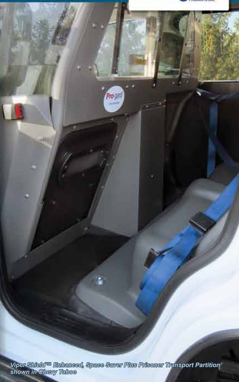
Viper Shield™ Enhanced, Space Saver Plus Prisoner Transport Partition shown in Chevy Tahoe