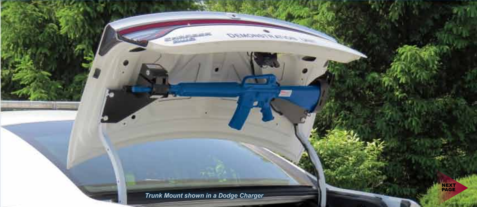
Trunk Mount shown in a Dodge Charger

Having weapons both secured and ready when the situation demands is direly important to every officer. Having the weapon and accessories of choice can make all the difference when seconds count. Officers will like that our Tri-Lock™ Weapon Mounting System accommodates any weapon or accessory at a cost fleet managers can work with. We also offer a wide selection of other mounting locations/ styles to meet agency preference. All of our gun racks come with a momentary switch with eight second timer and a choice of three gun lock key styles: handcuff, vending, or straight.