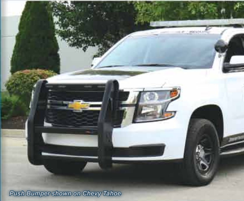
Push Bumper shown on Chevy Tahoe

In today's market, officers have a plethora of protective gear options available to help them function safely. Likewise, adding our external protection to cruisers gives them and the officer added protection.